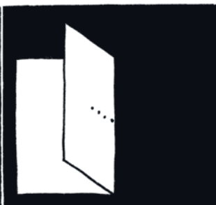
Fold to the left