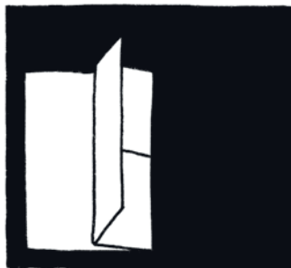
Fold top to the right