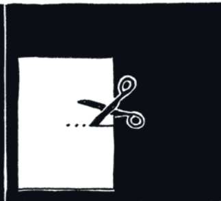
Cut where marked.