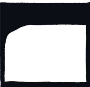
Turn to the left