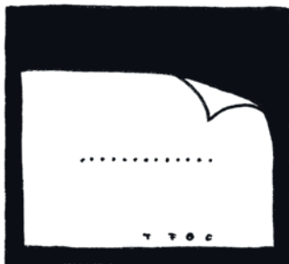
Print page 2